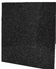
Black and silver - Glass