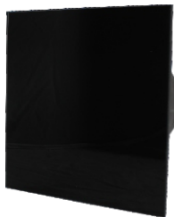
Black sheen/mate - Glass