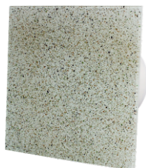
Mosaic beige - Glass