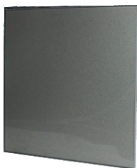
Asphalt - Glass