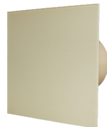
Ecru - Glass