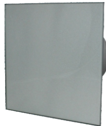
Inox - Glass