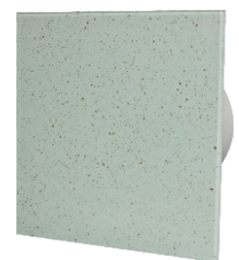
White and Gold - Glass