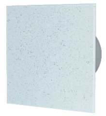
White & silver - Glass